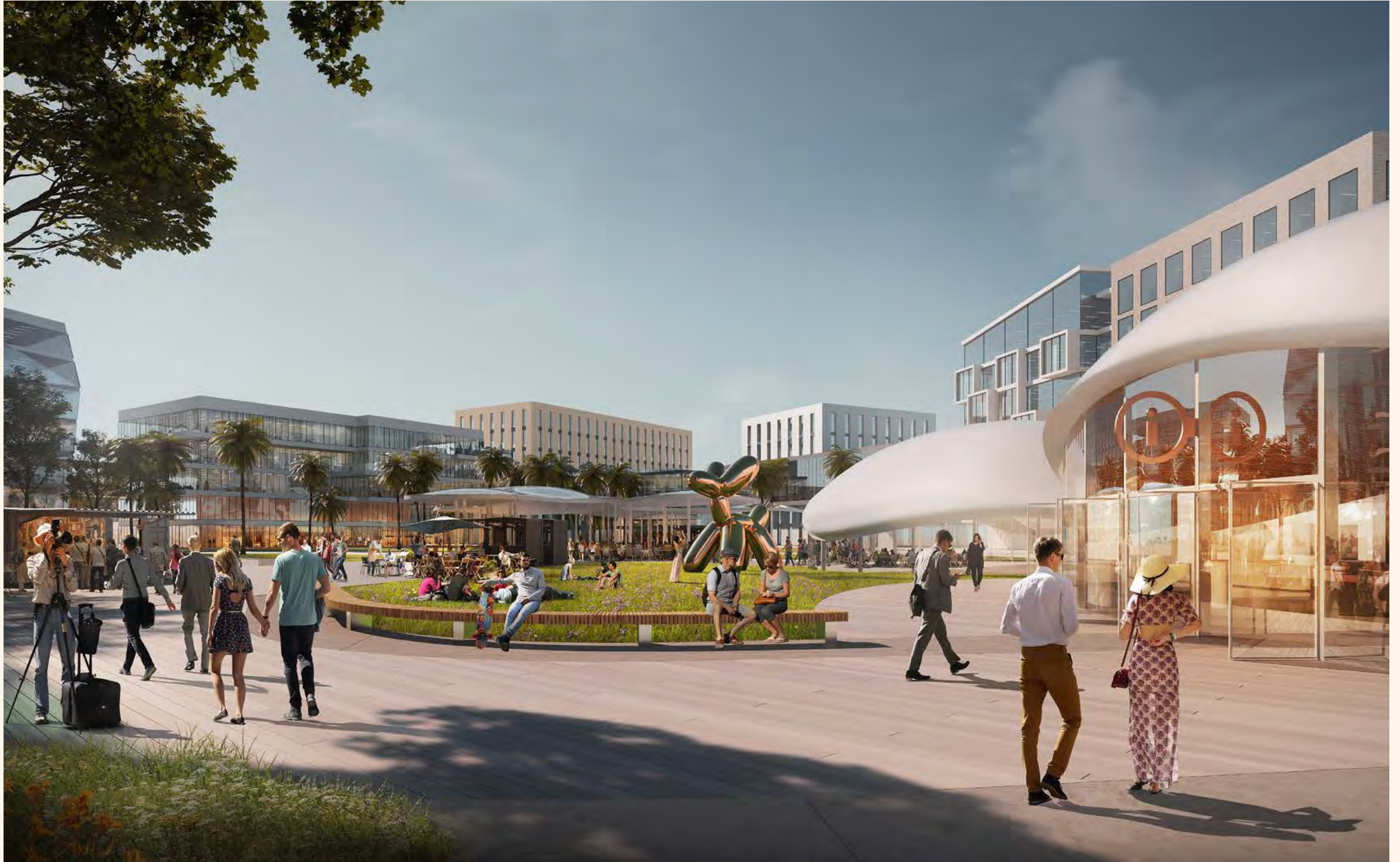
*FIGURE THREE: PLAZA