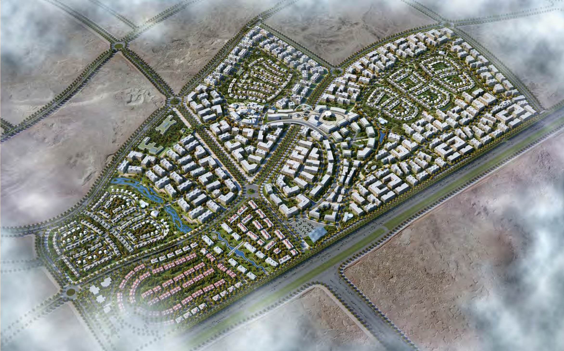
*FIGURE ONE: FULL MASTER PLAN